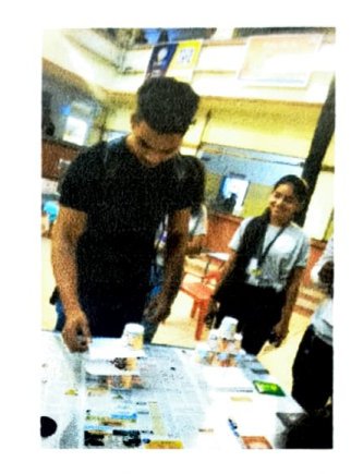
Student trying hands on Kheech na Halke

Event No. 5: Student Symposium based on the Essence of Democracy was conducted under topics such as Citizenship and National Identity; Civil Liberties & Denial of access to E-resources on 31<sup>st</sup> January, 2020.