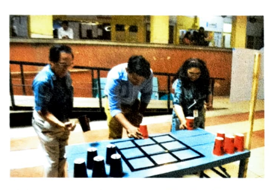
Staff trying their hands on Tic Tac Toe