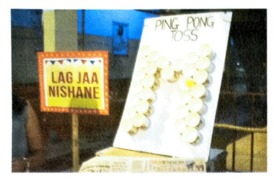
Miniamusement Game_Lag Jaa Nishane

Event No 4: "Mini-amusement Park" based on amusement park theme had individual and group games with value of fun and joy on 3<sup>rd</sup> January, 2020.